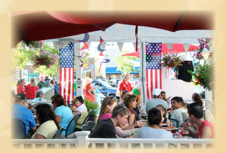
The Patio, Rehoboth Beach, DE