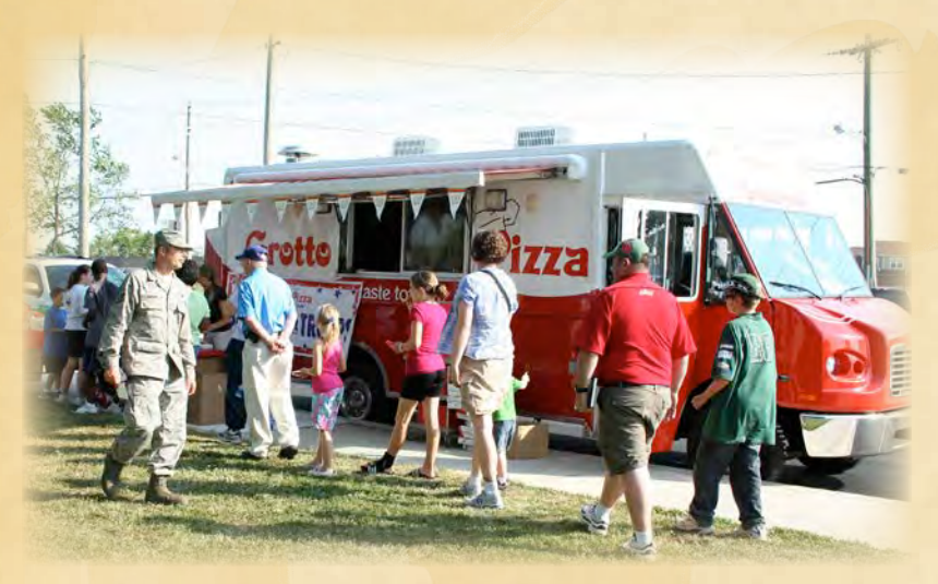
Grotto Pizza Mobile Unit