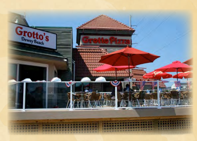
Dewey Beach, DE