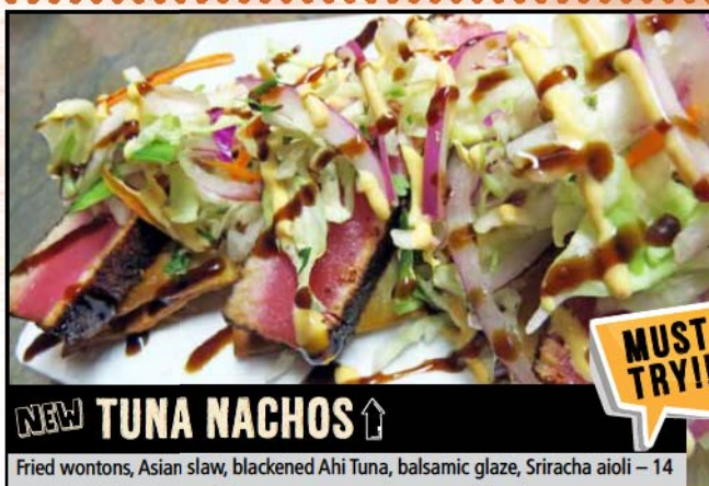
NEW TUNA NACHOS ↑

Fried wontons, Asian slaw, blackened Ahi Tuna, balsamic glaze, Sriracha aioli – 14