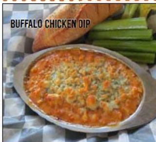
BUFFALO CHICKEN DIP