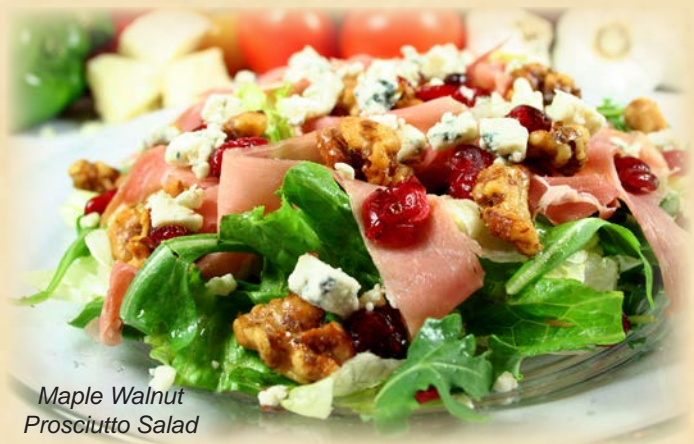
Maple Walnut Prosciutto Salad

a fresh blend of romaine, iceberg and arugula topped with prosciutto, gorgonzola, roasted walnuts and dried cranberries; served with a maple walnut vinaigrette (810 cal)