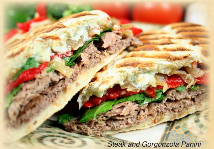
Steak and Gorgonzola Panini

thinly shaved ribeye steak, gorgonzola, caramelized onion, roasted red peppers and arugula (700 cal)