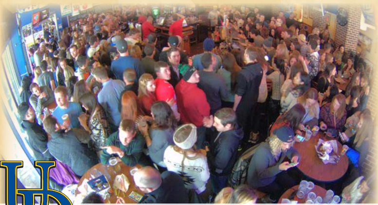
Official Pizza of UD Athletics