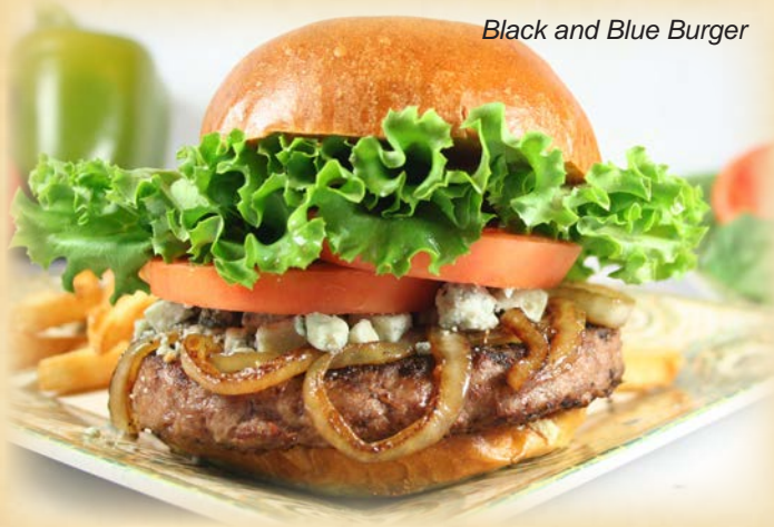
Black and Blue Burger

All burgers and sandwiches served on Grotto's NEW Brioche Bun with lettuce, tomato and your choice of beach fries or sautéed vegetables