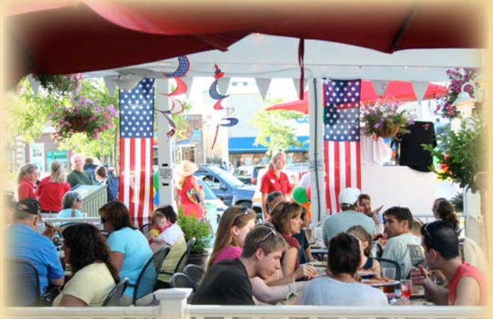
The Patio, Rehoboth Beach, DE