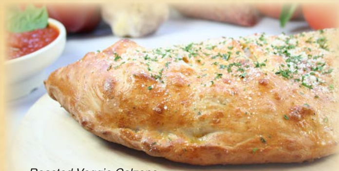
Roasted Veggie Calzone

spinach marinated in extra virgin olive oil and garlic, with Grotto's unique blend of cheeses (680 cal/serving, 2 servings)