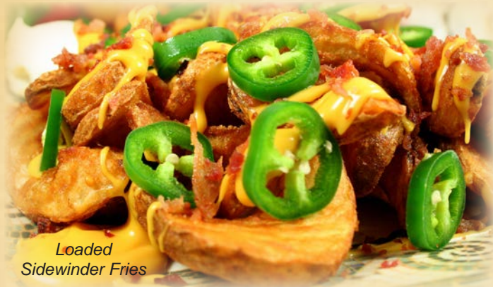
Loaded Sidewinder Fries

sidewinder fries loaded with melted cheese, bacon, jalapeños and sour cream reg (735 cal/serving, 2 servings) lg (695 cal/serving, 4 servings)