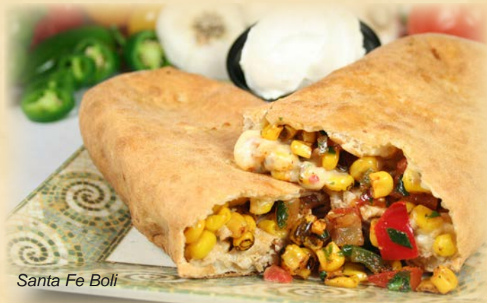
Santa Fe Boli

Philly style chopped all-white chicken, roasted corn & tomato salsa and pepperjack cheese; served with sour cream (560 cal/serving, 2 servings)