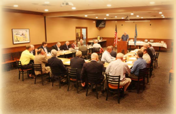
Private Dining in our Dover Restaurant