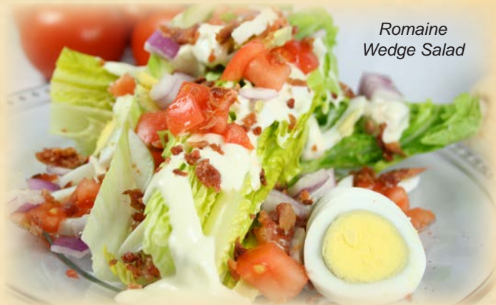
Romaine Wedge Salad

crispy romaine lettuce topped with roma tomatoes, crumbled bacon, red onion and hard-boiled egg; served with chunky blue cheese dressing (510 cal)