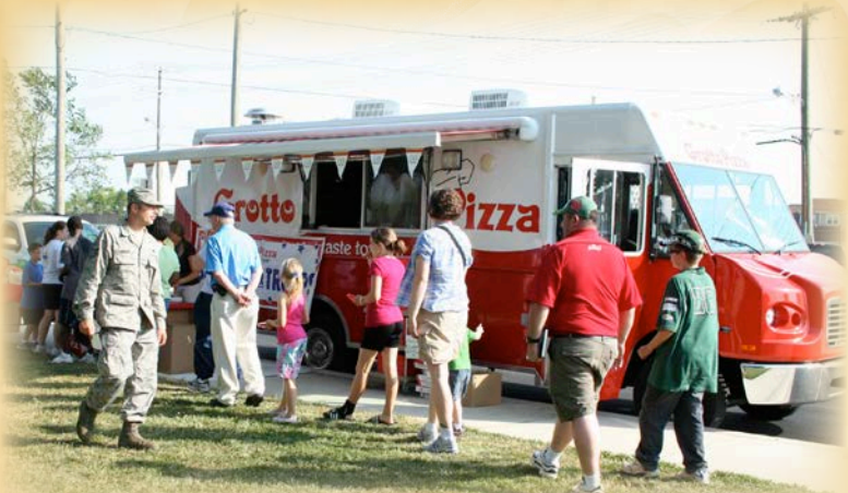
Grotto Pizza Mobile Unit