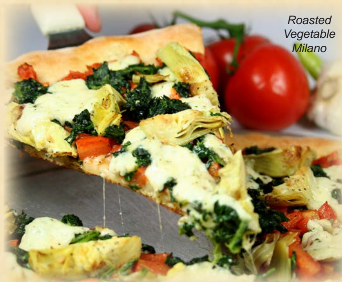
Roasted Vegetable Milano