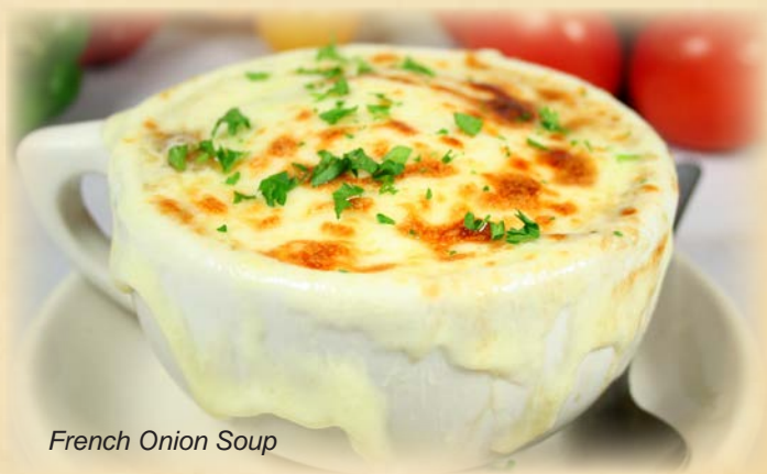
French Onion Soup