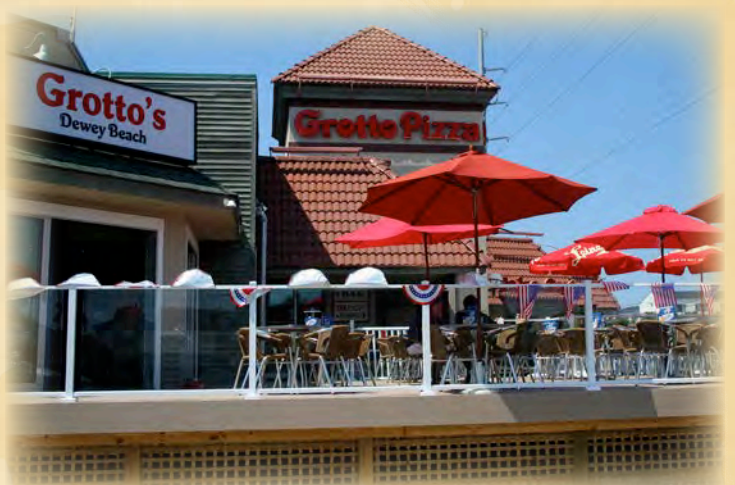
Dewey Beach, DE