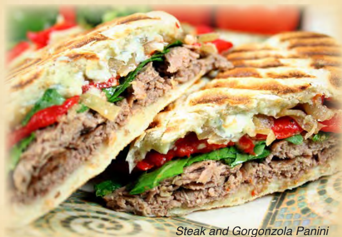
Steak and Gorgonzola Panini

thinly shaved ribeye steak, gorgonzola, caramelized onion, roasted red peppers and arugula