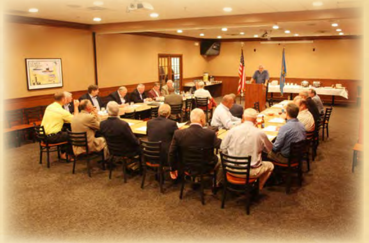
Private Dining in our Dover Restaurant