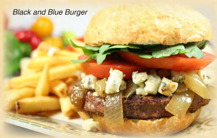
Black and Blue Burger

in our homemade Grotto sauce with melted provolone cheese reg 6" lg 12"