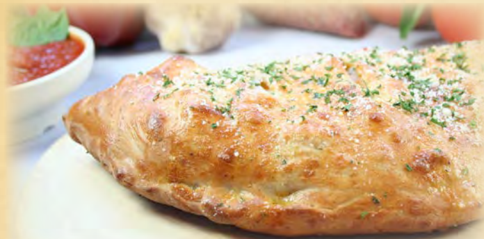
Roasted Veggie Calzone

spinach marinated in extra virgin olive oil and garlic, with Grotto's unique blend of cheeses