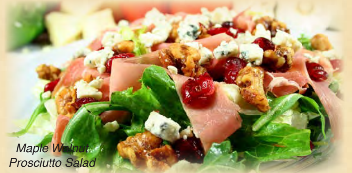
Maple Walnut Prosciutto Salad

a fresh blend of romaine, iceberg and arugula topped with prosciutto, gorgonzola, roasted walnuts and dried cranberries; served with a maple walnut vinaigrette