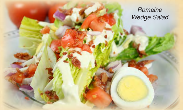
Romaine Wedge Salad

crispy romaine lettuce topped with roma tomatoes, crumbled bacon, red onion and hard-boiled egg; served with chunky blue cheese dressing