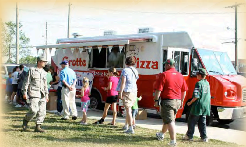
Grotto Pizza Mobile Unit