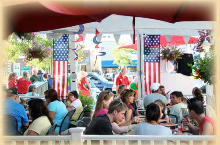
The Patio, Rehoboth Beach, DE