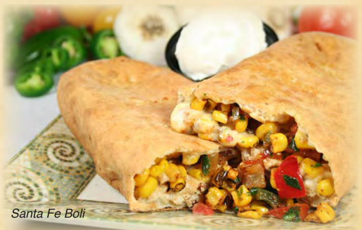
Santa Fe Boli

Philly style chopped all-white chicken, roasted corn & tomato salsa and pepperjack cheese; served with sour cream