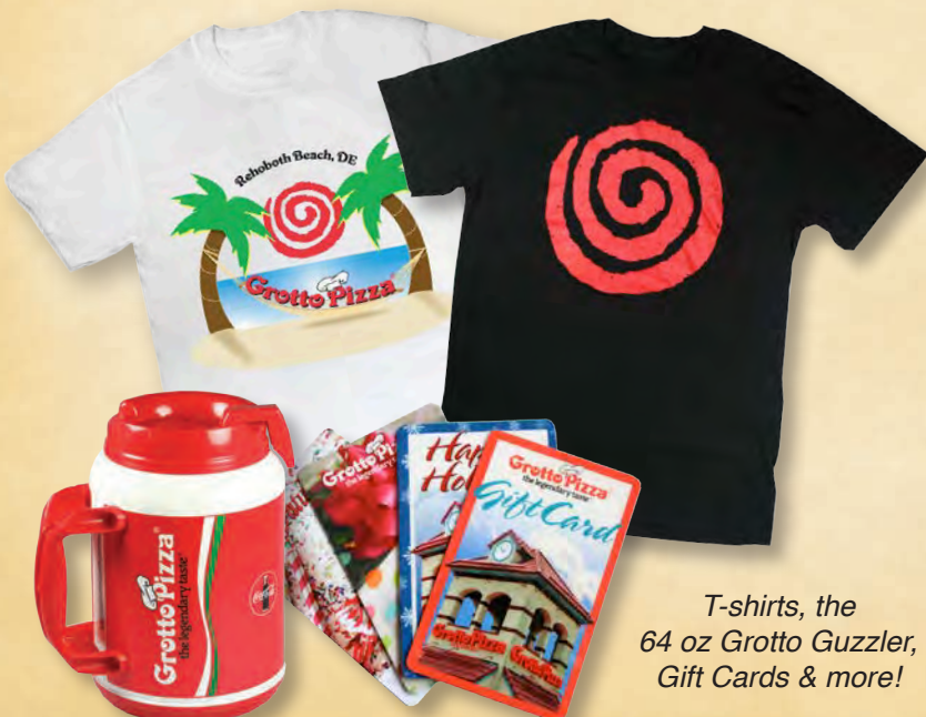
T-shirts, the 64 oz Grotto Guzzler, Gift Cards & more!